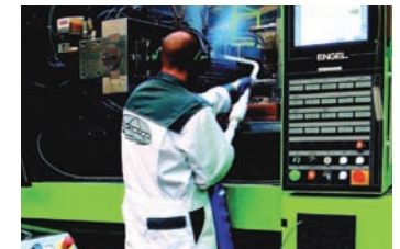
Maintenance - Machine Cleaning

1-780-799-1879 | 1-888-301-0044 | www.WesternDryIceBlasting.com