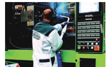
Maintenance - Machine Cleaning

1-780-799-1879 | 1-888-301-0044 | www.WesternDryIceBlasting.com